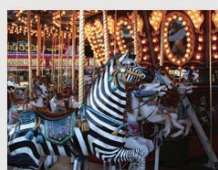
AMUSEMENT PARK TICKET