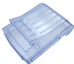
Spill proof cover